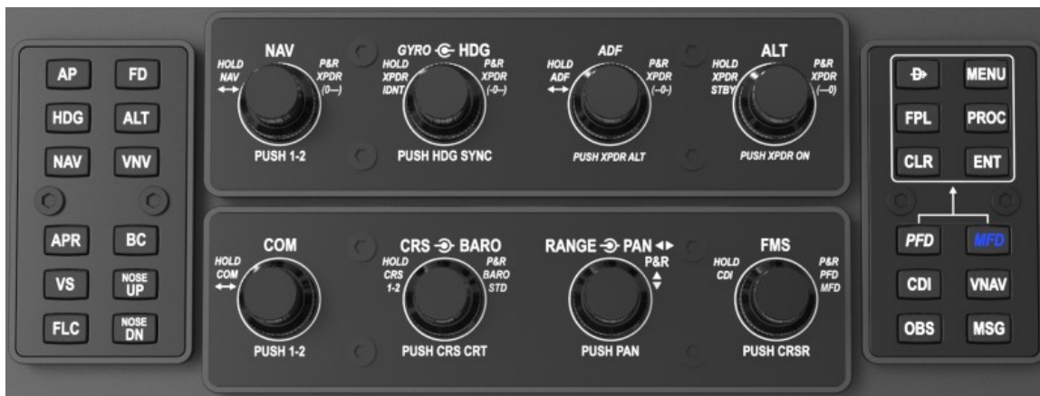
Figure 2 – Device Test screen

Open it by clicking the DEVICES TEST button from the main screen.