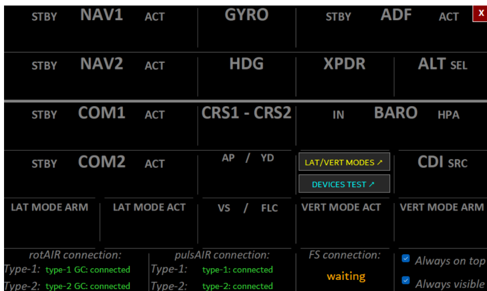
Figure 1 – Main screen

After launching the application, the main screen will appear as shown below.